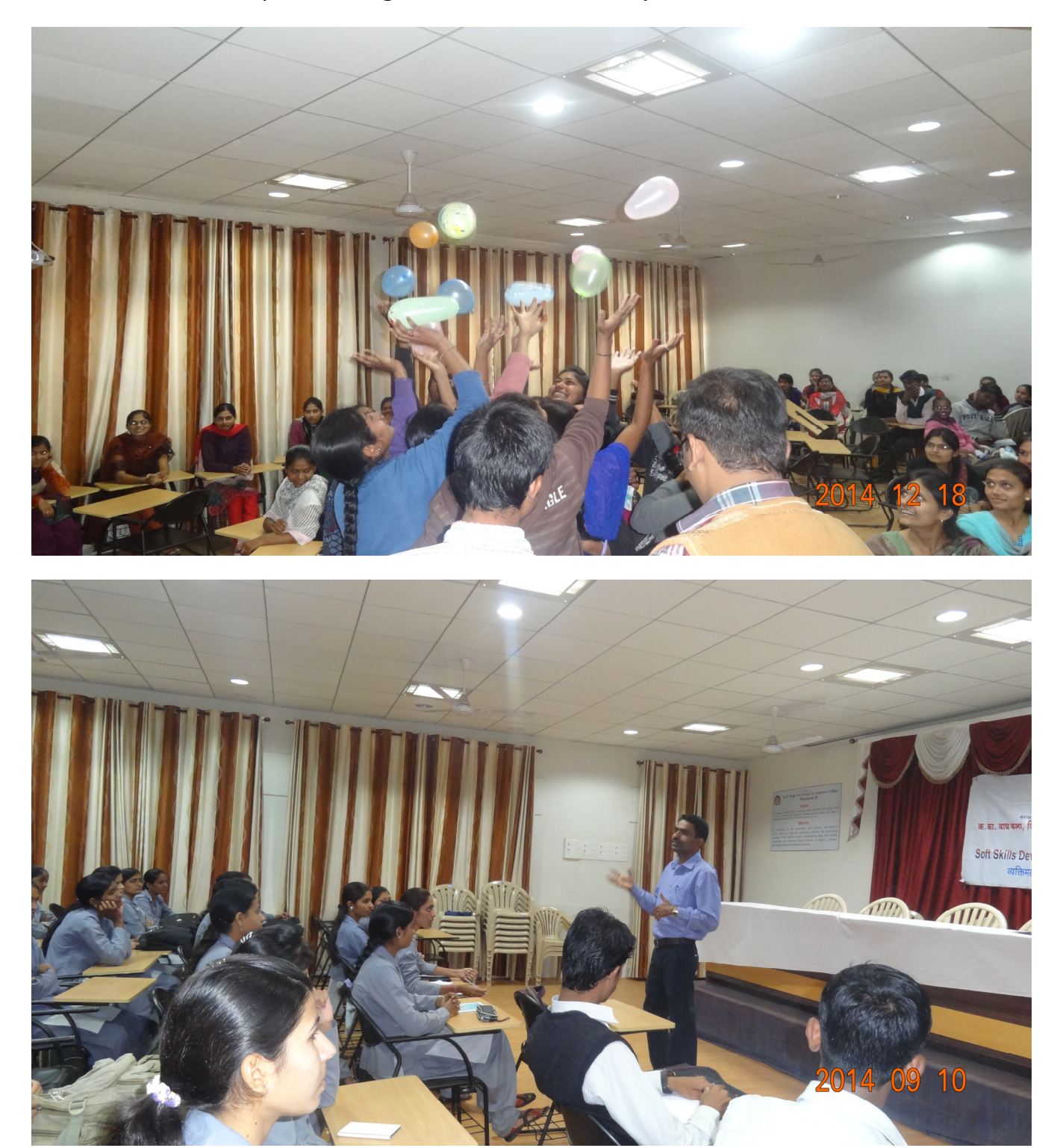
Skill Development Programmes for Differently abled Students